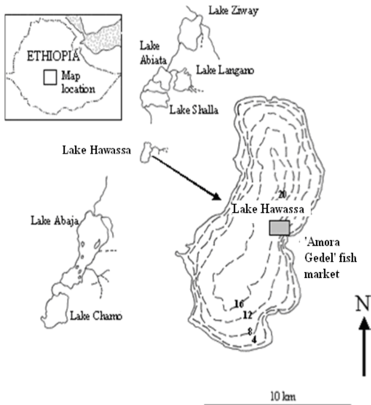
Fig.1. The location of Lake Hawassa in Ethiopian Rift Valley, and its bathymetric map; the rectangle indicates the sampling site (after Zerihun Desta et al. , 2006).

The lake is found to the west of Hawassa town and has an area of 90 km 2 and average depth of 11 m and lies between 6°33'-7°33' N and 38°22'-39°29' E, with an altitude of 1680 m (Elias Dadebo, 2000; Yosef Tekle-Giorgis, 2002) (Fig. 1). The lake is the smallest of the Ethiopian rift valley lakes and its main inflow is River Tikur Wuha that drains the swampy wetland called Shallo, but has no obvious surface outlet (Elias Dadebo, 2000).